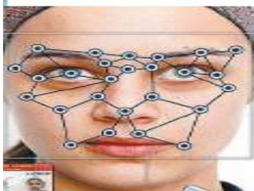
Figure 1: geometric representation of a person

In this technique feature are extracted using the size and the relative position of important components of images. In this technique under the first method firstly the direction and edges of important component is detected and then building feature vectors from these edges and direction. Canny filter and gradient analysis usually applied in this direction. Second, methods are based on the grayscales difference of unimportant components and important components, by using feature blocks, set of Haar-like feature block in Ad boost method [6] to change the grayscales distribution into the feature.